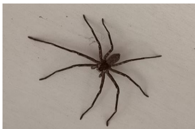
Figure 6. Heteropod venatoria , Family Sparassidae (Researcher, 2024).

Description: Male and female Nephila pilipes have different characteristics. Females tend to be darker in color, the cephalothorax and abdomen are black while the legs of each joint are yellow. Male nephila are lighter brownish-red in color and have a smaller body size (Taek et al., 2020). This species is easily recognized by its very large size and black color with a pair of yellow stripes on the abdomen and this spider experiences extreme sexual dimorphism where the size of the female is larger than the male (Dhiya'ulhaq et al., 2022).