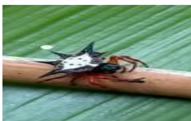
Figure 3. Argiope versicolor , Family Araneidae

Description: The head is black and white like batik, the dorsal part is bright yellow to faded and has black dots, while the ventral part, especially the abdomen, is yellow in an inverted U shape. Males of this species are smaller in size and plain light brown in color. The black legs have white stripes on each segment. Female spiders reach a body length of up to 6 cm and are black and yellow, while males are brown with a length of up to 2 cm (Asriani et al., 2010).