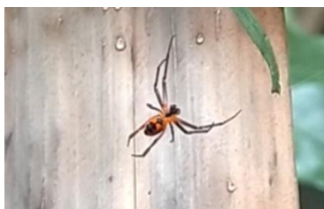
Figure 12. Opadometa fastigata , Family Tetragnathidae (Researcher, 2024).

Description: It has four large eyes in a trapezoidal shape at the top of the skeleton. The two central eyes are largest and face forward, the two smaller eyes at the back face sideways or backwards. In front of the four eyes is a row of four small eyes. Body coloration varies but is usually gray or brown. There is a light band on the cephalothorax that shows contrast behind the head. The abdomen has a light mark followed by a series of paired light dots. It has banded colored legs. Males have black coloration around the eyes (Guarisco, 2020).