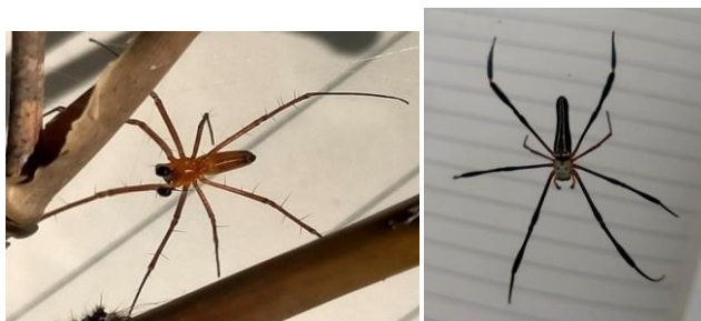
Figure 5. (a) Nephila pilipes (Male), (b) Nephila pilipes (Female), Family Nephilidae

Description: The head is black, the body is hairy, the back is white mixed with reddish, there are also reddish black spots, the abdomen and chest are dominant in red color and fine hairs on body parts. In contrast to research conducted by Limbu et al. (2018), found spiders of the Araneidae family with a description of a black head, a hairy body, a greenish yellow back, there are also reddish black spots and fine hairs on the body.