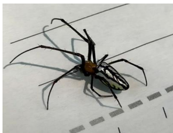
Figure 8. Leucauge tessellata , Family Tetragnathidae (Researcher, 2024).

Description: This spider has a blackish body, blackish legs with brownish color lines on the joints. The abdomen is elongated with a blunt tip. Males have a smaller body size than females ((Dhiya'ulhaq et al, 2022).