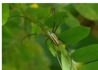
Figure 9. Leucauge argyra , Family Tetragnathidae (Researcher, 2024).

Description: It has a long cephalothorax with a cephalic region that can be raised and covered with hair. The lateral eye is smaller than the median eye and is located on a prominent tubercle. The anterior median eye is smaller than the posterior median eye. Cheliverae are strong, large and dark brown in color. Abdomen curved with two front and one rear hump, silver-white with white and black spots and stripes. Legs are smooth, long and covered with hair and bone (Gupta et al., 2015).