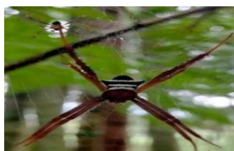
Figure 4. Macracantha hasselti , Family Araneidae

Description: The body is blackish white and brownish. The back is black with several horizontal white stripes, the legs are brownish black, the chest is blackish, and the entire body is covered with fine hairs. Family Araneidae sits in its net displaying dramatic brownish-black markings. In contrast to research conducted by Limbu et al. (2018) found the spider family Araneidae with a description of a blackish white and yellow body, legs and chest and abdomen equipped with fine hairs.