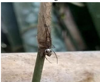
Figure 10. Tylorida ventralis , Family Tetragnathidae (Researcher, 2024).

median eye. Cheliverae are strong, large and dark brown in color. Abdomen curved with two front and one rear hump, silver-white with white and black spots and stripes. Legs are smooth, long and covered with hair and bone (Gupta et al., 2015).