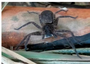
Figure 7. Tigrosa aspersa , Family Lycosidae (Researcher, 2024).

Description: It has a hairy brown body from the cephalothorax to the legs and between males and females there is no difference in body color, the abdomen is elongated round with slightly tapered ends (Taek et al., 2020). Females are light brown in color and in front of the eyes there is a horizontal white line. Males are white with black markings on the cephalothorax and spotted markings on the legs that resemble leopard markings (Dhiya'ulhaq et al., 2022).