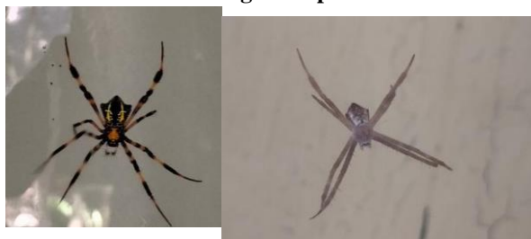
Figure 2. Argiope appensa , Family Araneidae

Description: The head is black and white like batik, the dorsal part is bright yellow to faded and has black dots, while the ventral part, especially the abdomen, is yellow in an inverted U shape. Males of this species are smaller in size and plain light brown in color. The black legs have white stripes on each segment. Female spiders reach a body length of up to 6 cm and are black and yellow, while males are brown with a length of up to 2 cm (Asriani et al., 2010).