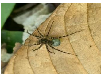
Figure 11. Pardosa milvina , Family Lycosidae (Researcher, 2024).

Description: Can be distinguished from other species of Tetragnathidae because it has an oval abdomen with a slightly tapered tip on the upper side so that the abdomen looks almost rectangular from the side. The white abdominal color is decorated with dark spots on the upper side of the side (Dhiya'ulhaq et al., 2022).