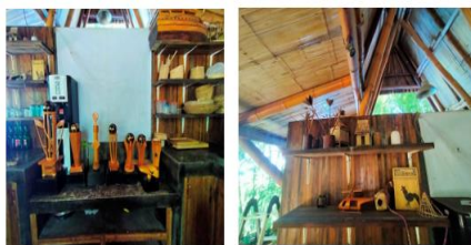
Figure 5. Furniture/Mebel from Bamboo