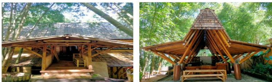
Figure 1. Roof Cover from Bamboo

Bamboo can be used as a roof cover that can be designed with the latest innovations and display a cool atmosphere. The application of bamboo on ceilings is based on bamboo characteristics that can be shaped according to the desired design. The use of bamboo as a ceiling material can help reduce the heat so that the room feels cooler.