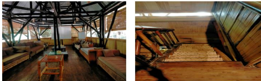
Figure 3. Floor from Bamboo

Bamboo is used in buildings as a floor cover because it has the advantages of flexibility and the ability to withstand heavy pressure or loads. In terms of design, the appearance of the floor with bamboo material can make a natural and charming impression. Bamboo flooring is categorized as a cheaper material than hard wood. The design of this bamboo floor is also available in a variety of colors and styles. Other advantages of the use of this bamboo material are also assessed as environmentally friendly, and its maintenance is not difficult.