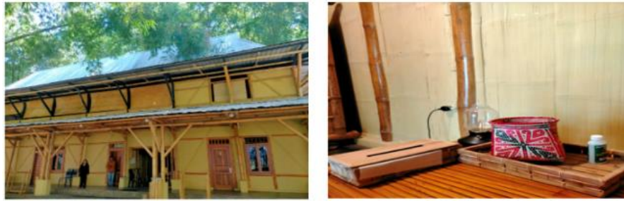
Figure 2. Walls from Bamboo