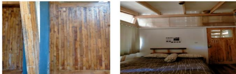
Figure 4. Door and Window from Bamboo

Bamboo is used as a material in complementary elements of space such as windows and doors because of its properties that are resistant to various weather conditions, such as rain and sunlight. Application techniques can be some bamboo sticks arranged neatly, lamination techniques, or a form of webbing.