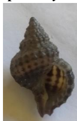
Figure 29. Species Gyrineum natator

The Siphonariidae family is a gastropod family that has the characteristics of having a shell with a fold on the right side with a coat hole, and there is a clear lateral loop on the left side (Nuha, 2015). One species of this family found on the Aimere Coast is Siphonaria normalis , as shown below.