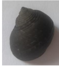
Figure 20. Species Littorina littorea

The family Cerithiidae is a family of gastropods characterized by a crocheted shell with brown and black spots, a thick and sharp elongated shell, and a large number of axial twists. The shell has a dextral rotation direction with an elongating aperture and a short siphon canal, and a columella without a strong spiral fold. (Maretta dkk, 2019). Species of this family found include Clypeomorus inflata and Clypeomorus subbrevicula , as shown below.