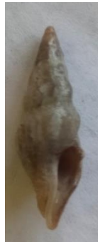
Figure 26. Species Bela nebula

The family Trochidae is a family of gastropods that has a large shell in the shape of a brown-shaped white scratch with axial engraving and a spiral with a thong, as well as a flat shell base. The shell size is about 6 mm long and 5 mm wide. It has a wide and narrow syphon and a dectral direction of rotation. (Maretta dkk, 2019). One of the species of this family found on the Aimere Coast is Trochus lineatus , as shown below.