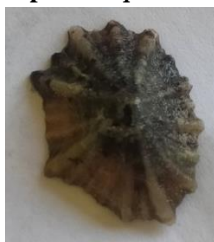
Figure 30. Species Siphonaria normalis

The Siphonariidae family is a gastropod family that has the characteristics of having a shell with a fold on the right side with a coat hole, and there is a clear lateral loop on the left side (Nuha, 2015). One species of this family found on the Aimere Coast is Siphonaria normalis , as shown below.