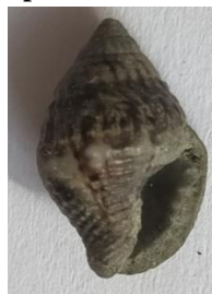
Figure 23. Species Anachis Terpsichore

The family Columbellidae is a family of gastropods that has a small, thick shell with a surface without axial lines, a brownish shell, and white, black, and slightly yellow spots. In the direction of the dextral rotation, with an elongated spire and a long and narrow aperture, there is also a short siphon canal (Maretta dkk, 2019). The species of this family found on the Aimere Coast are the species Anachis terpsichore and Pardalinops testudinaria , according to the following picture.