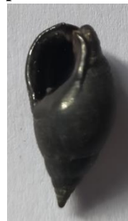
Figure 25. Species Vexillum anthracinum

The family Mangeliidae is a family of gastropods with a small shell that is tall and has a fusiform to biconic shape. This family does not have an operculum with deep anal sinuses on the substructural tracks as well as a thick calus. (Nuha, 2015). One of the species of this family found on the Aimere Coast is the Bela nebula , as shown below.