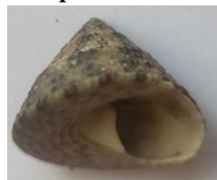
Figure 27. Species Trochus lineatus

The family Trochidae is a family of gastropods that has a large shell in the shape of a brown-shaped white scratch with axial engraving and a spiral with a thong, as well as a flat shell base. The shell size is about 6 mm long and 5 mm wide. It has a wide and narrow syphon and a dectral direction of rotation. (Maretta dkk, 2019). One of the species of this family found on the Aimere Coast is Trochus lineatus , as shown below.