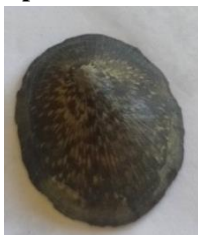
Figure 28. Species Cellana testudinaria

The Cymatiidae family is a gastropod family that has a medium- to very large size with a rough shell. The periostracum part is well developed and almost always has an outstanding shell part with a horned operculum with a large multispiral protokonch that usually disappears in adulthood. (Nuha, 2015). One species of this family found on the Aimere Coast is Gyrineum natator , as shown below.