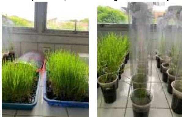
Figure 1. Rice plants at 15 days after sowing (DAS) were used as feed for Spodoptera frugiperda

Rice seeds of the Kuriak Kusuik local variety were soaked in water until the entire surface of the seed was submerged with a water level of about \pm 2 cm. After soaking, the seeds were sown on 30 cm \times 24 cm \times 4 cm trays filled with soil. After two weeks, the rice seedlings were transferred into plastic containers (6 cm in diameter and 11.5 cm in height), then covered with a mica plastic tube and gauze. Each container contained five clumps of rice plants. Watering was done every two days (Figure 1).